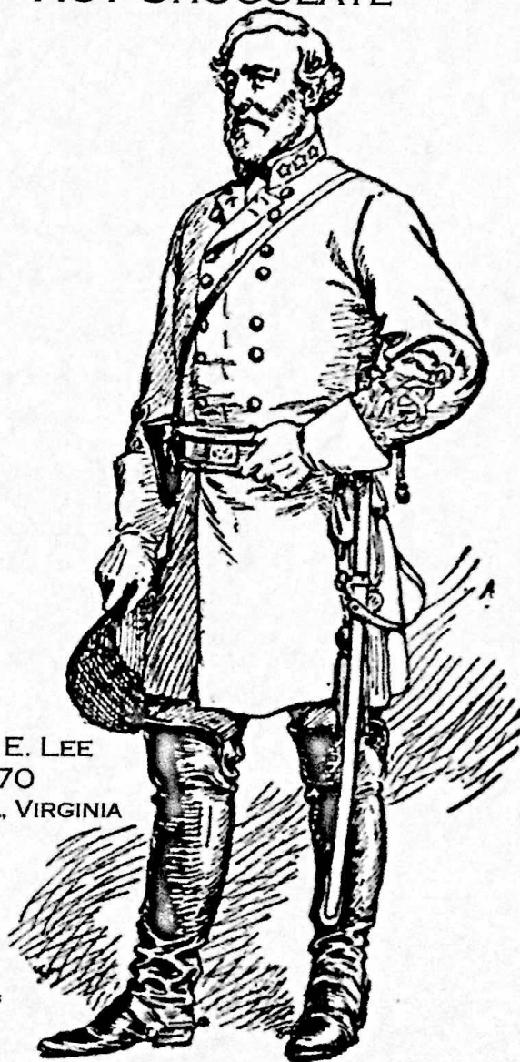
GEN. ROBERT E. LEE 1807-1870 STRATFORD HALL, VIRGINIA

MILK CHOCOLATE MILK LEMONADE ORANGE JUICE HOT CHOCOLATE